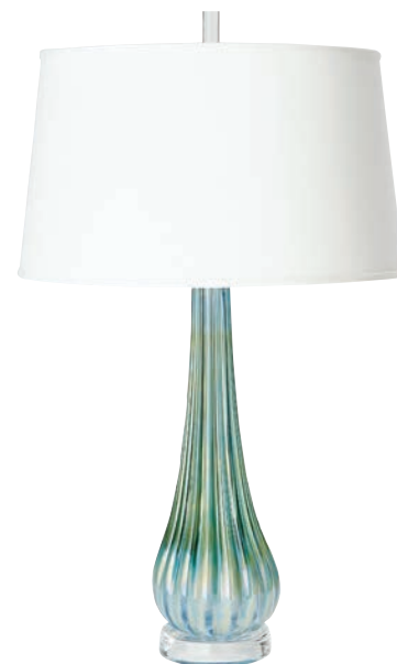
Studio A Home