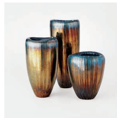
STUDIO A HOME