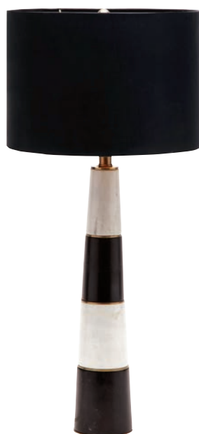
Made Goods, $900