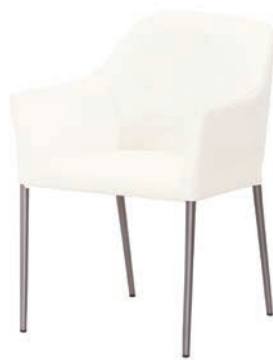
STAR INTERNATIONAL FURNITURE