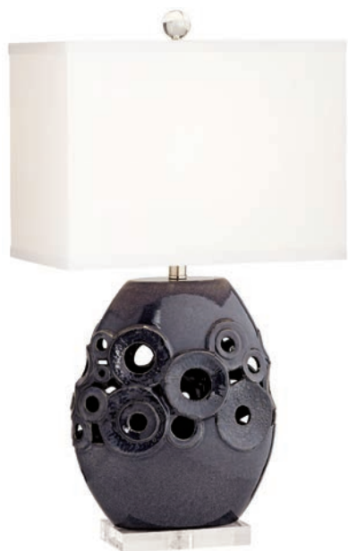
Pacific Coast Lighting