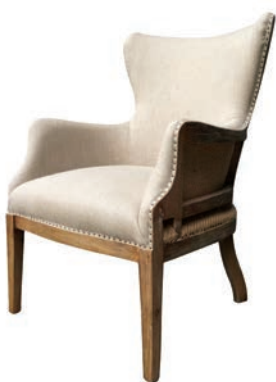
SOUTHERN SKY HOME