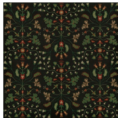
SPICHER AND COMPANY