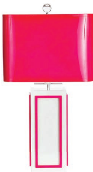
Meg Caswell for Couture, $425