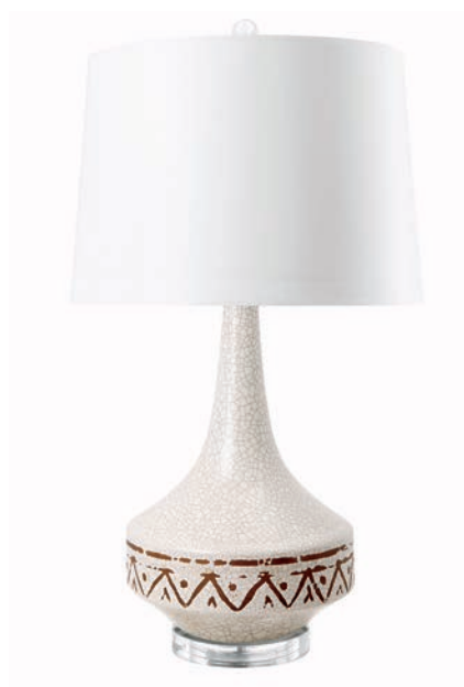
Bungalow 5, $564