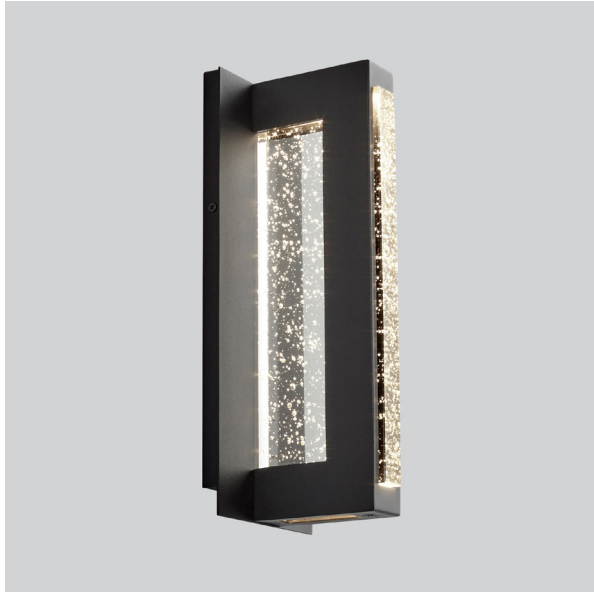
-15 Black (Lit)