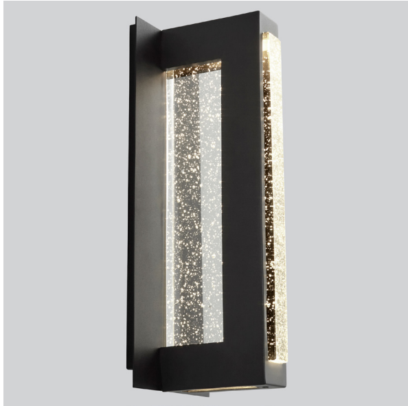
-15 Black (Lit)